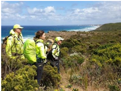
Dom Dom Saddle