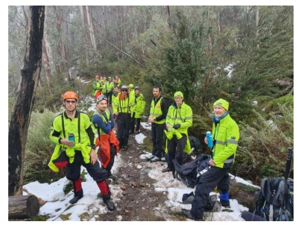
BSAR annual training that was scheduled at Mount Stirling in August 2019 was cancelled due to an extreme weather forecast.